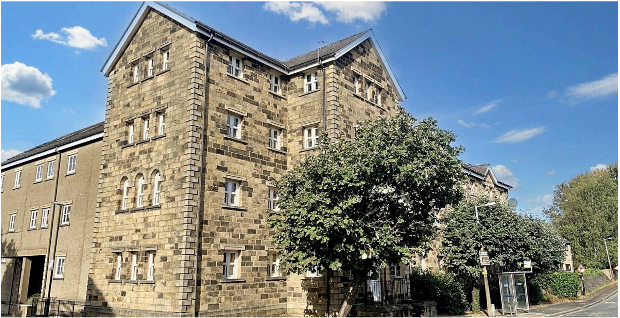
2 Bay View Court Station Road, Lancaster Lancaster