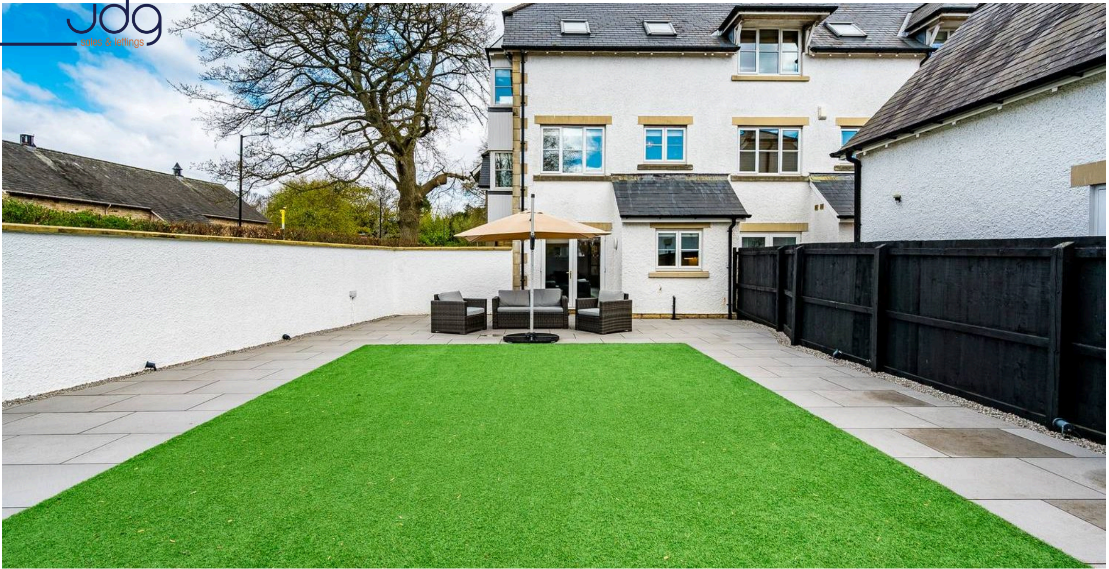
4 Acorn Close, Lancaster Lancaster